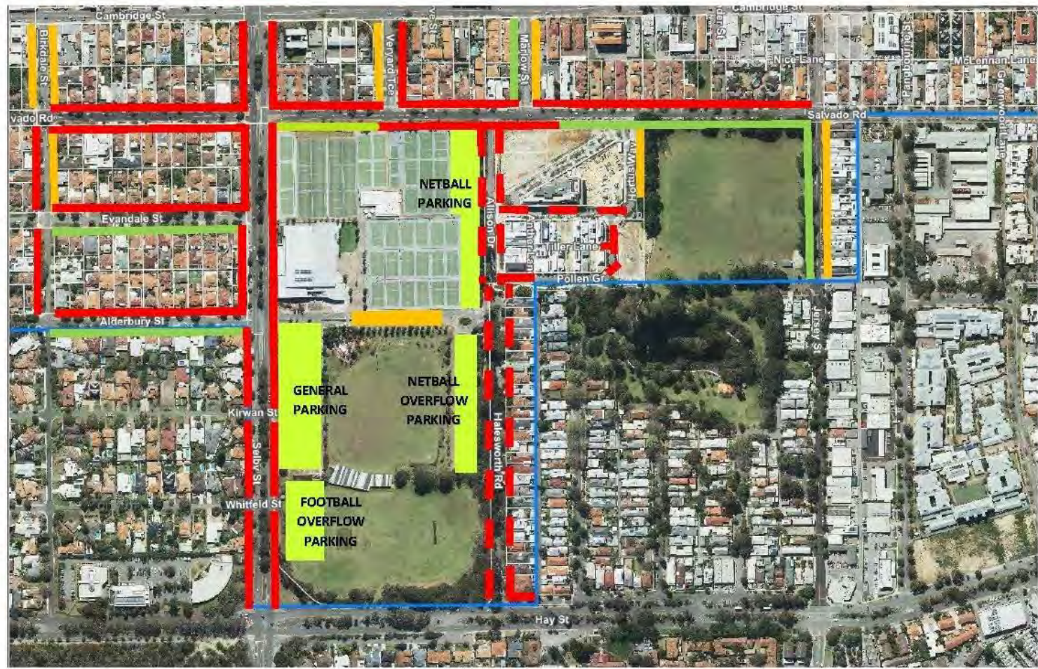
Wembley Sports Park Precinct Parking Map